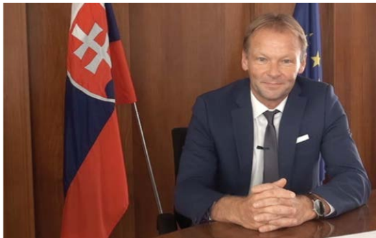
H.E. Minister Vazil Hudák addressing participants of the 6th European Cross-Border Dialogue in Uzhgorod

The 2015 Border Dialogue Award is in the right hands!