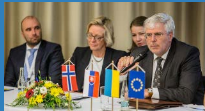
Košice (Hotel Yasmin), 26-27 November 2015